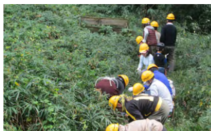
Weeding in the village forest