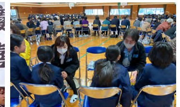
Taking part in a "place to talk with adults" at a local elementary school (Saga Plant, Saga)