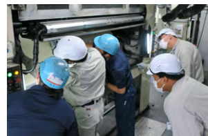
High schooler interns at a practical training session (Toppan Media Printech Kansai Co., Ltd., Osaka)