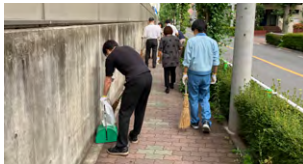
Beautifying and cleaning up off-premises once a month (Itabashi Plant, Tokyo)