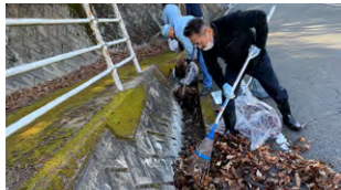
Participating in a community beautification/cleanup campaign (Fukuyama Plant, Hiroshima)