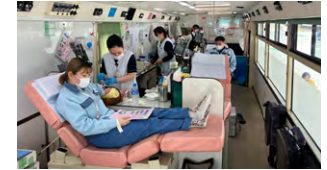
Kumamoto Plant, Kumamoto

Blood donation drives are held at Group sites in collaboration with Red Cross blood centers.