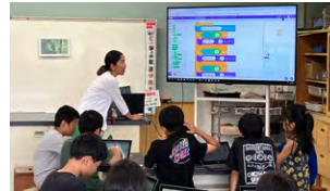
Teaching basic programming for a school club activity (ICT KOBO™ URUMA, Okinawa)

Onsite classes and exhibitions are held for students from neighboring elementary and middle schools to present an overview of TOPPAN's business and the products and services we offer.