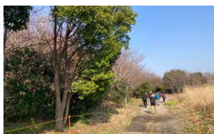
Walking in Umi-no-Mori Park

plants. Employees, employee families, and growing numbers of stakeholders are exploring biodiversity in native and non-native ecosystems in events like these. We expect our nature events to spur participants into action as environmental conservationists.