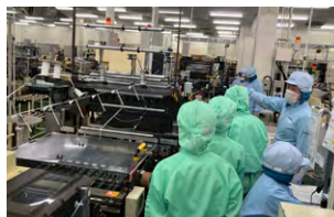
High school students on a plant tour (Fukusaki Plant, Hyogo)

Local high school students are taken on plant tours and enrolled in practical training sessions, working experience programs, and other learning activities at site facilities across the Group.