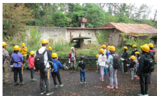
Conserving the village forest in Tama Zoological Park, Tokyo

TOPPAN collaborates with community groups and environmental NPOs to organize biodiversity-learning events. After a hiatus during the COVID-19 pandemic, participants returned in fiscal 2023 to an in-person workshop to make pencil brooches in a village forest in Tama Zoological Park, Tokyo. In March 2024 we also supported the “Umi-no-Mori Spring Festival,” a pre-inaugural event held for Umi-no-Mori Park, as a member of the Tokyo Sea Forest Club led by the Bureau of Port and Harbor, Tokyo Metropolitan Government. TOPPAN Holdings Inc. assisted with event operations and offered festival hosts and participants file folders made by T.M.G. Challenged Plus Toppan Co., Ltd. The folders are composed of paper handcrafted from waste by-products generated in TOPPAN