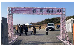
Umi-no-Mori Spring Festival (Tokyo Sea Forest Club)