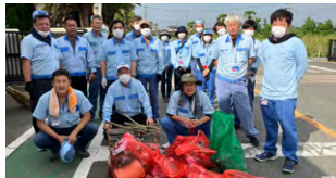
Cleaning up around the site (Kumamoto Plant, Kumamoto)

TOPPAN cooperates with residents and various organizations in the community to beautify and clean up local public spaces such as beaches, riversides, and parks.