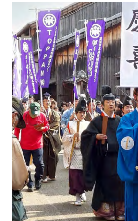
Participating in Kaido Matsuri festival (Mie Plant, Mie)

Group employees participate in and cooperate with festivals and various other events in the community.