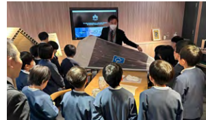
Holding a hands-on learning class for neighboring elementary school students at our "L·IF·E" showroom (Akihabara, Tokyo)