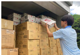
Stockpiling emergency provisions for employees and community members (Asaka Plant, Saitama)

TOPPAN Group sites open company facilities such as tennis courts and parking areas, distribute emergency stockpiles of food, and arrange other disaster relief activities for the members of their communities.