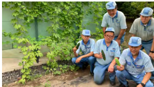
Installing a green curtain beside the welfare building (Kawaguchi Plant, Saitama)